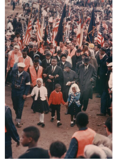
A civil rights march in 1965