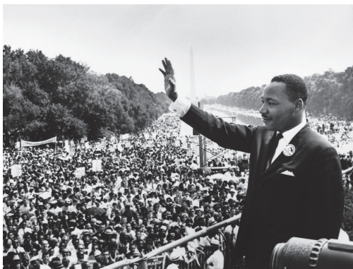
Martin Luther King Jr. addressing crowds in Washington, D.C., 1963